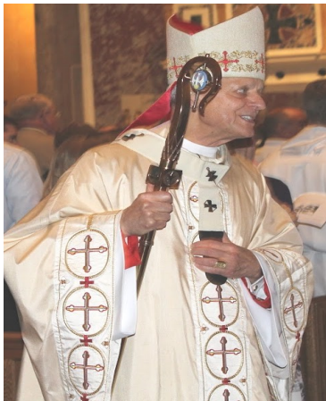
Cardinal Donald Wuerl